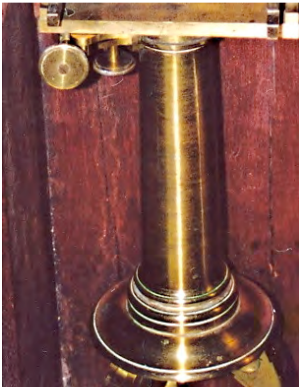
As received in need of cleaning and space available for slow-motion adjuster