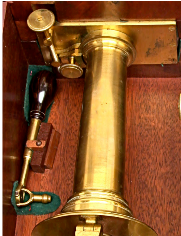
Adjuster securely mounted and out of the way