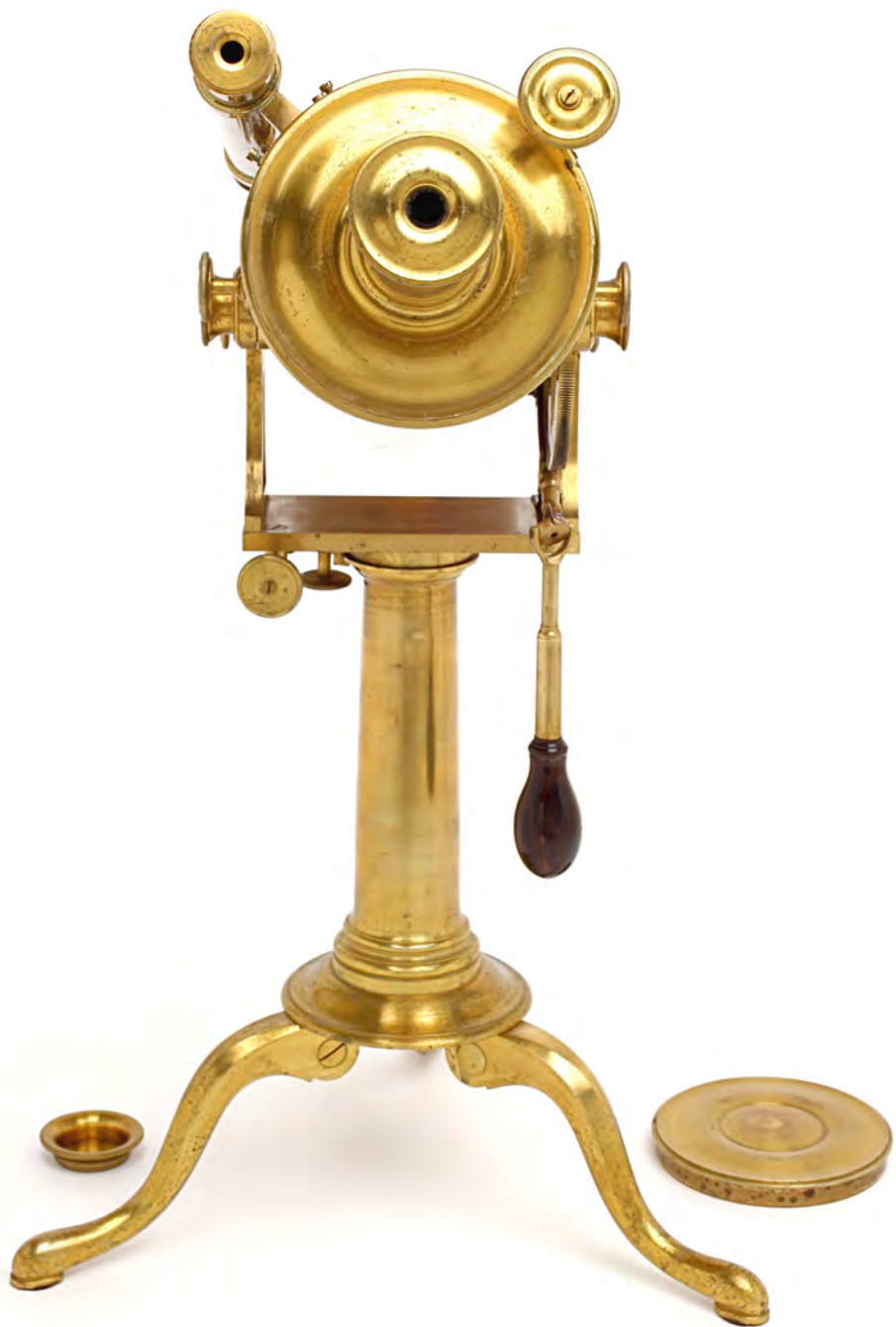
TRE8 10-mm Naime Reflecting Telescope with slow-motion control, c. 1760?