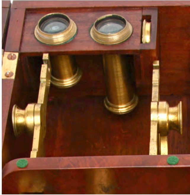
Newly fabricated eyepiece cover plate holder located over position of old vertical support board.