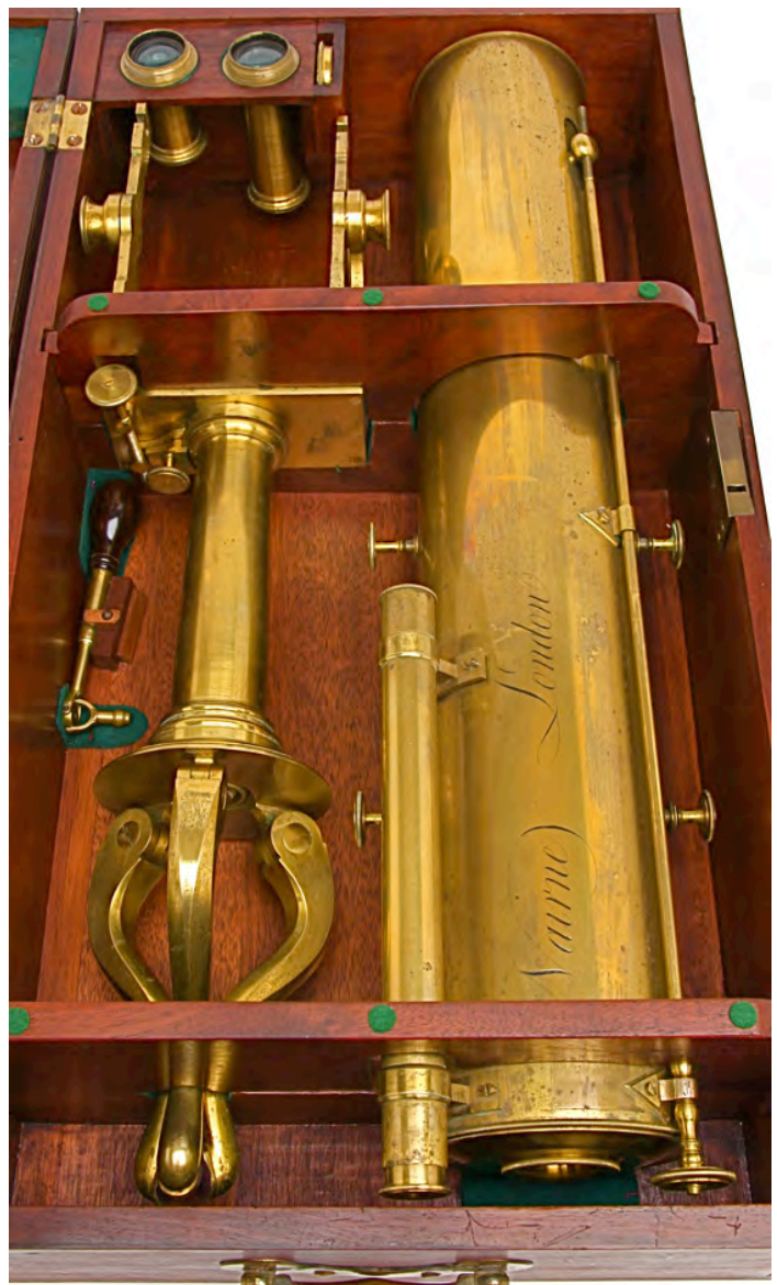
After cleaning and installation of accessories