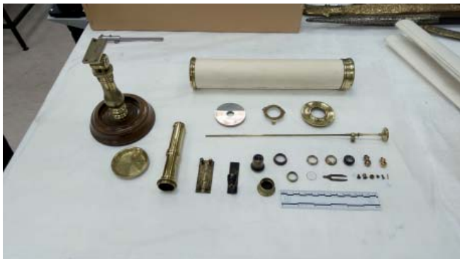
The components of the James Short Gregorian telescope held by the Otago Museum. It is currently being restored.

There are two contenders for New Zealand's second oldest telescope, both in Wellington. One is another, larger Short Gregorian, on display in the foyer at Space Place (formerly the Carter Observatory). It has roughly a 4-inch diameter primary mirror, an alt-azimuth mount, and a pillar and scroll-leg support. By the time it was made, Short had moved to London and had changed the form of his formula. The Space Place formula is "170/1086 = 18", which means that this is the 1086th telescope made by him, and the 170th with a primary mirror of about 18-inches focal length. Guess what?